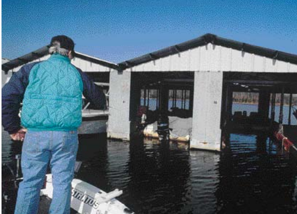
An underhand pitching presentation is useful for delivering your lure to hard-to-reach corners of docks.

Plastic flotation is used to support some docks. Moody has caught plenty of nice slabs around this synthetic material. "These docks don't look as fishy as those